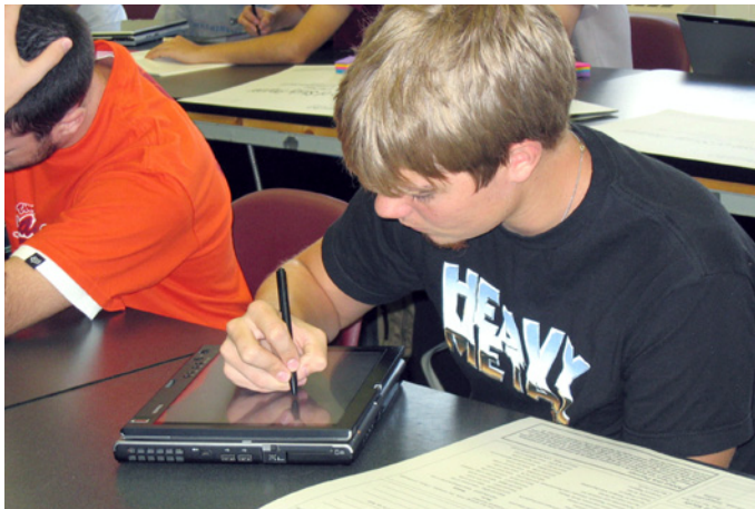
An engineering student uses Fujitsu Tablet PC to take notes in class. Because the notes are in electronic form versus written by hand in a spiral notebook, students are able to search and organize information more easily.